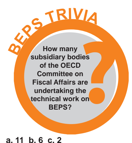
See answer on page 35

If the aforementioned two points are read together then potentially all MNCs operating in India have a threat of being questioned on existence of location savings because at some level there may be a cost arbitrage by operating in India. In conclusion, the issue of location savings in emerging countries requires further debate and policy guidance from the administration such that taxpayers can consider it appropriately in their FAR analysis.